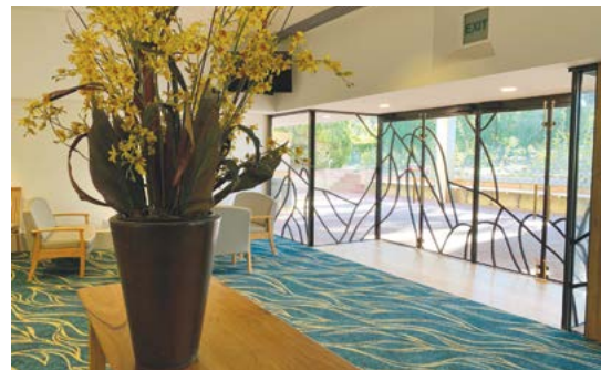
Norfolk Condolence Lounge

IN THE EVENT OF LARGER CROWDS THE CHAPEL HAS SCREENS FOR VIEWING THE SERVICE IN THE OUTDOOR AREA.