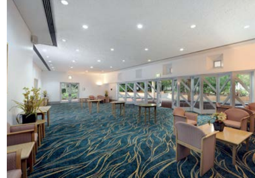
Brown Condolence Lounge