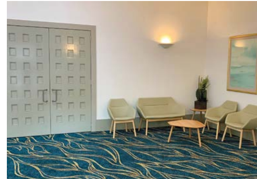
Dench Condolence Lounge