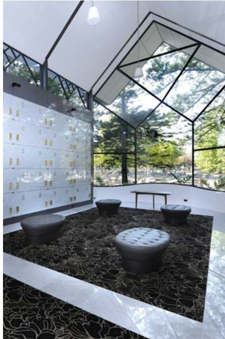
St. Francis Chapel

Crypts are available for pre-purchase or at the time of need. For more information or to request a copy of our mausoleum brochure contact Client Services at Karrakatta on 1300 793 109. Information regarding the mausoleums can also be downloaded from our website at www.mcb.wa.gov.au .