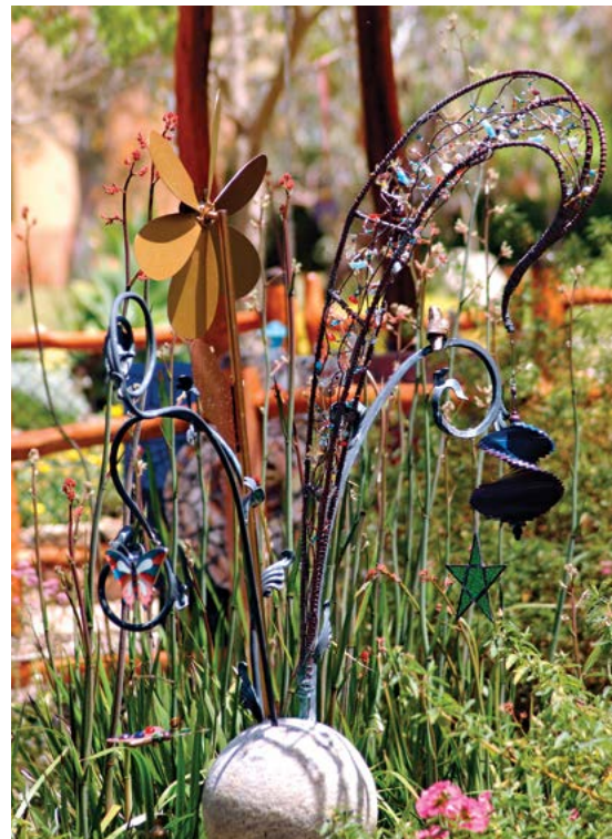
Sculpture in the Infant's Butterfly Garden

A children's memorial garden is located adjacent to the burial area, enabling memorial plaques to be placed following cremation.