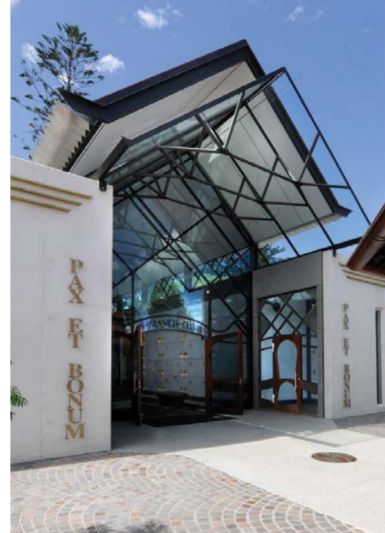
All Saints Mausoleum features St. Francis Chapel