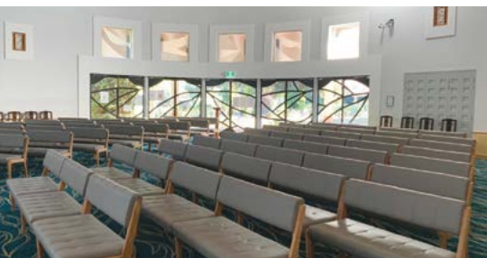
The Norfolk is the largest chapel at Karrakatta Cemetery

All indoor chapels are air conditioned and possess high quality sound systems.