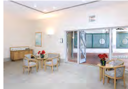
Dench Condolence Lounge