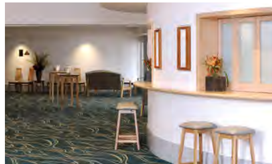
Norfolk Condolence Lounge

IN THE EVENT OF LARGER CROWDS THE CHAPEL HAS SCREENS FOR VIEWING THE SERVICE IN THE OUTDOOR AREA.