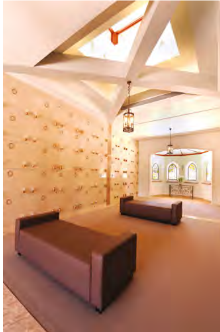
The Chapel within All Saints Mausoleum

Crypts are available for pre-purchase or at the time of need. For more information or to request a copy of our mausoleum brochure contact Client Services at Karrakatta on 1300 793 109. Information regarding the mausoleums can also be downloaded from our website at www.mcb.wa.gov.au .