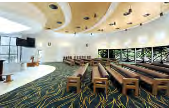
The Norfolk is the largest chapel at Karrakatta Cemetery

There are three indoor chapels at Karrakatta: the Norfolk , Brown and Dench . Karrakatta also offers an open outdoor chapel.