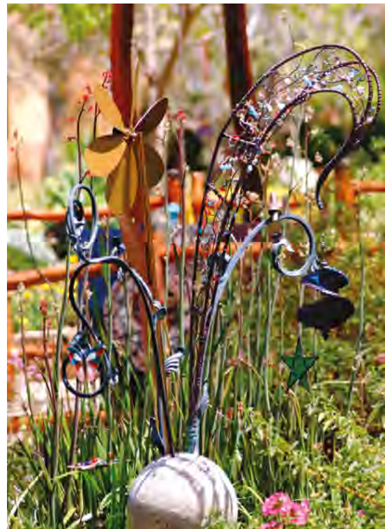
Sculpture in the Infant's Butterfly Garden

A children's memorial garden is located adjacent to the burial area, enabling memorial plaques to be placed following cremation.