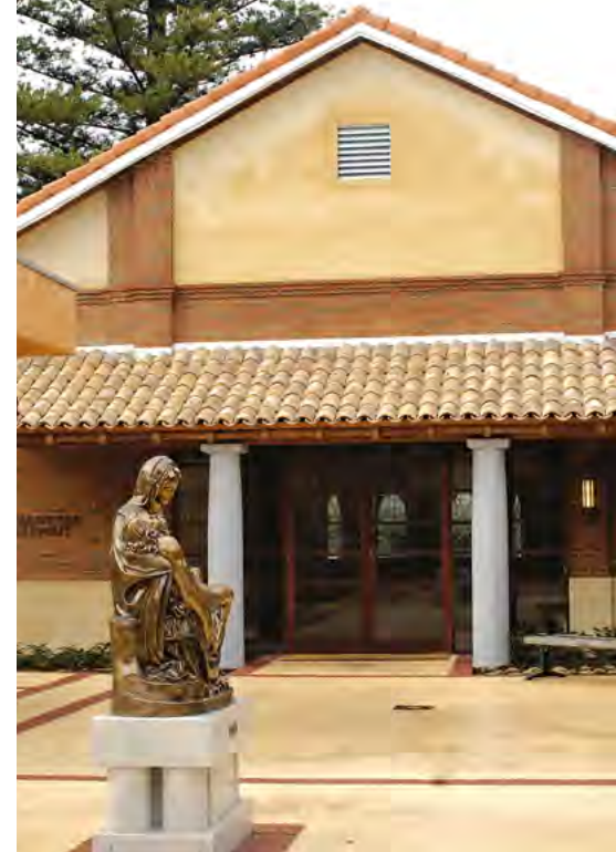
The Chapel of the Holy Spirit located within Karrakatta Mausoleum