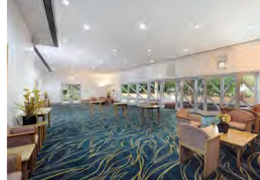
Brown Condolence Lounge