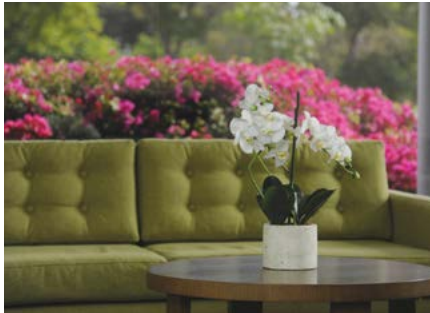
East Condolence Lounge

Livestreaming is available in both East and West Chapels. Please consult with the Funeral Director to make arrangements.